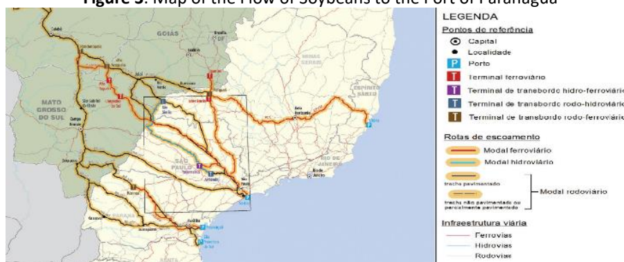
Figure 3. Map of the Flow of Soybeans to the Port of Paranaguá

A problem was developed to analyze the costs in cargo transportation, verifying the possible routes for four (4) origins, two (2) transshipments and four (4) destinations, comprising one (1) Dummy, with different costs for each of them, mixing two types of modes, the road, taking the cargo to the place of disembarkation. Even today, the rail modal represents only 20.2% of the operation in Porto, according to data from the latest APPA report (2022), the multi-modal option (rail and road) was used because it is more advantageous, considering the points of origin of flow, as shown in Figure 3.