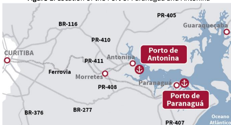
Figure 1. Location of the Port of Paranaguá and Antonina

Also, according to Wilson Sons (2018), it stands out from other ports due to its solid infrastructure and specialized knowledge in port operations to ensure efficient service to users. Despite considerable investments in modernization and restructuring, including computer systems and improvements to the quay strip, it still faces common challenges compared to other ports, such as Santos and São Francisco do Sul. Issues such as the reduced draft and limited extension, which need to be reconsidered to accommodate larger vessels, are some of the obstacles faced.